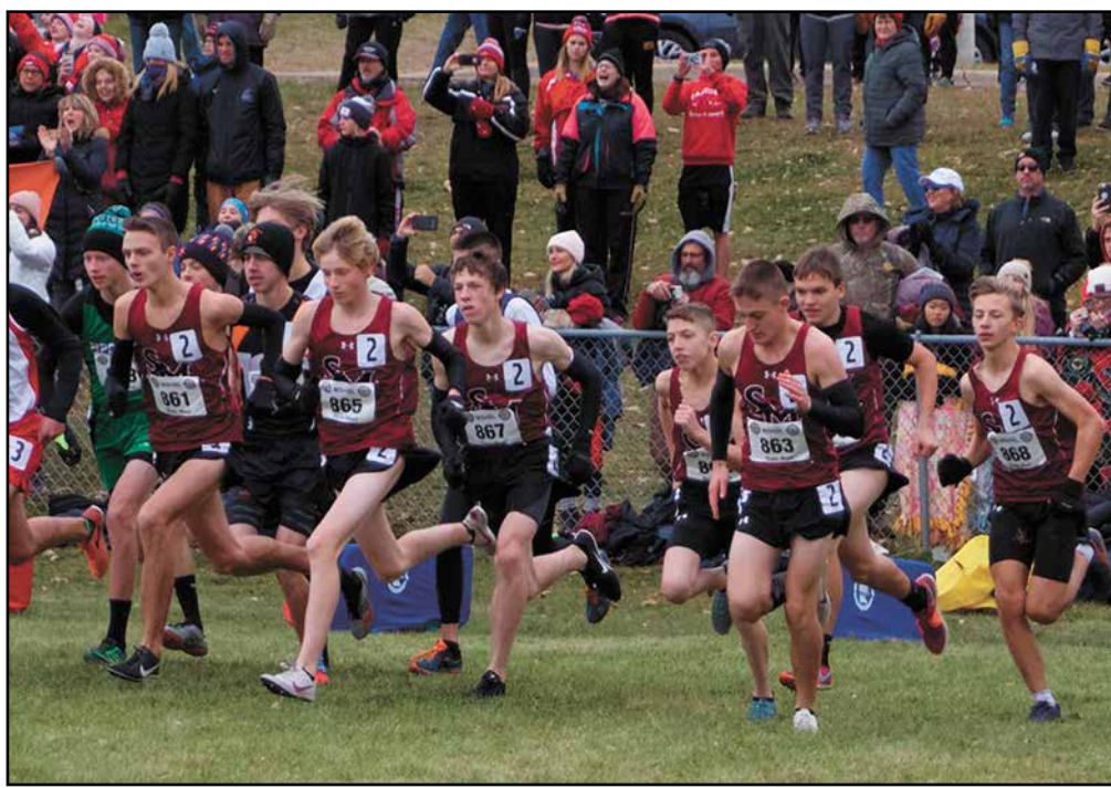
Staples-Motley runners take off from the starting line at the state cross country meet.